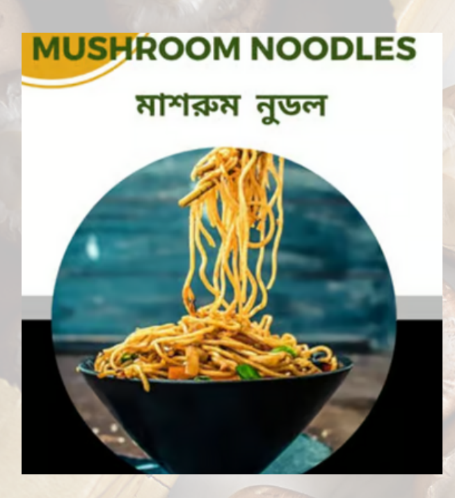
Mushroom Noodles 100 gm Rate: ₹149 (50% OFF)