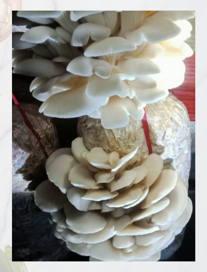
ONDC Registered product on Mystore app

https://www.mystore.in/en/prod uct/oyster-mushroom-spawnpleurotus-flabellatus-? seller=6423da177fef25631fd2470a