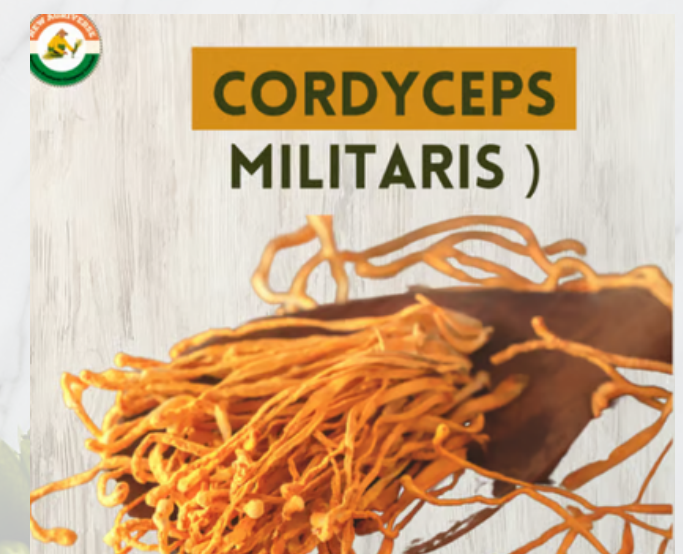
ONDC Registered product on Mystore app

https://www.mystore.in/en/product/co rdyceps-mushroom-extract-tincture30ml-60-servings-1? seller=6423da177fef25631fd2470a