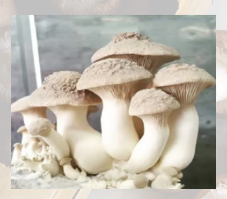
King Oyster Mushroom Spawn (Pleurotus eryngii) 2kg Rate: ₹349 (30% OFF)

Spawns are 100% organic and free from molds, providing a safe and clean start to your mushroom cultivation.