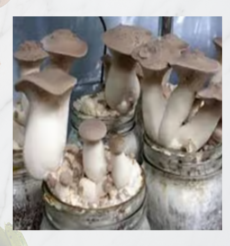
ONDC Registered product on Mystore app

Once cultivated, these mushrooms are perfect for a variety of cooking methods, including grilling, sautéing, and roasting.