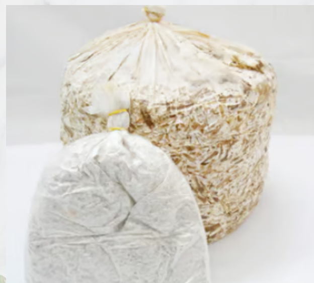
ONDC Registered product on Mystore app

Begins with a unique blue pinhead, evolving into either white or grey shades based on light exposure, adding a visual appeal to your cultivation.