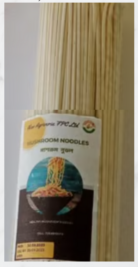
ONDC Registered product on Mystore app

Mushrooms are known to be low in calories and fat while providing dietary fiber, vitamins, and minerals.