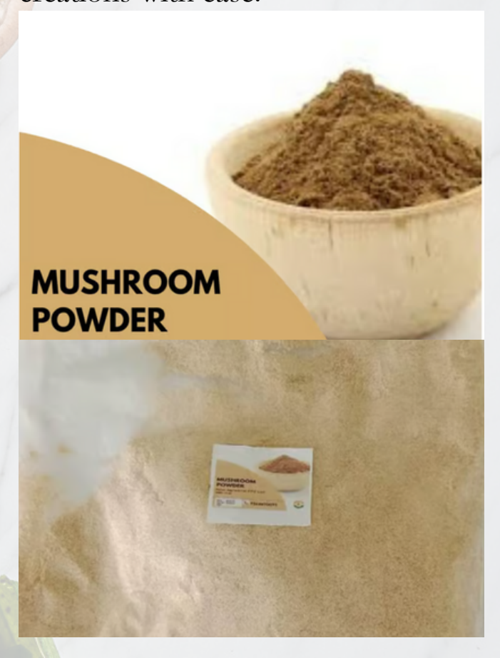
ONDC Registered product on Mystore app

Discover the pure essence of Oyster Mushrooms in our Organic Dry Mushroom Powder. Carefully cultivated and dried, this versatile ingredient adds rich umami flavor and convenience to your cooking. Harvested at peak freshness, our premium-quality mushrooms are transformed into a finely ground powder, capturing their unique taste and aroma. Elevate your culinary creations with ease.