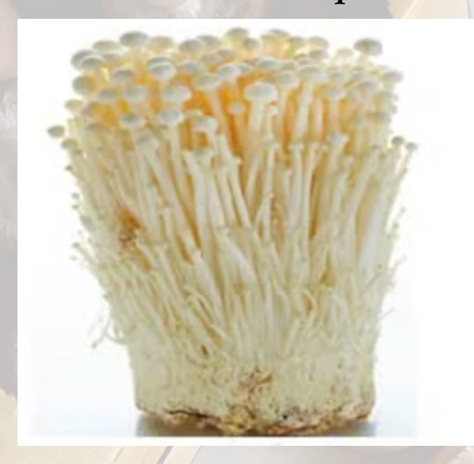
Enoki Mushroom Spawn (Flammulina velutipes) - 2 kg

Rate: ₹399 (33% OFF) Instructions: Spawn from mushroom cultivation