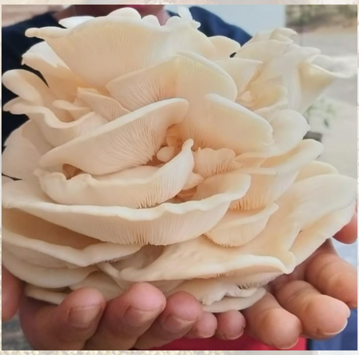
Oyster Mushroom Spawn (Pleurotus flabellatus) 2KG

Storage Conditions: Store at cool and dry place