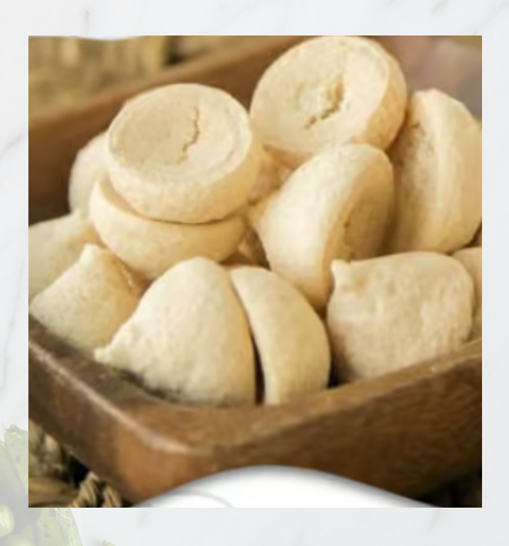
ONDC Registered product on Mystore app

The Mushroom Bori adds a burst of umami flavor to a wide range of dishes. Whether you're preparing curries, stir-fries, soups, or even salads, these small mushroom morsels infuse your creations with their rich, earthy taste