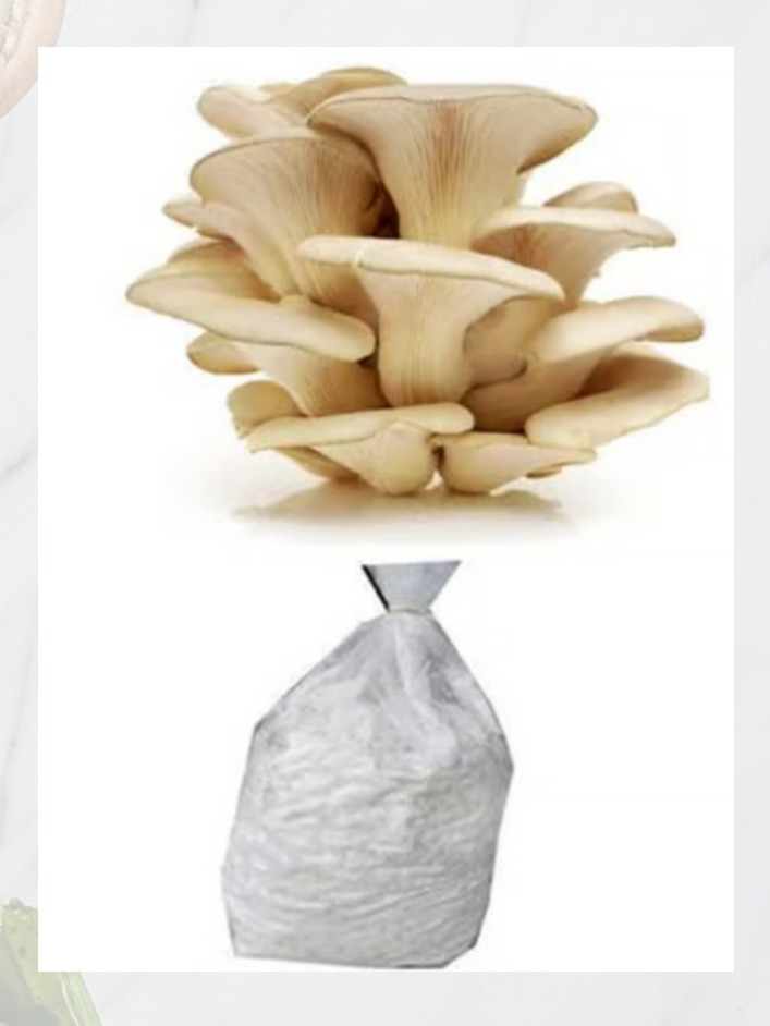
ONDC Registered product on Mystore app

White Oyster Mushrooms are matured, ready-to-use spawn is an excellent choice for both beginners and experienced growers, aiming to achieve a substantial mushroom yield. Spawns are fully matured and primed for immediate use, ensuring a smooth and efficient cultivation process. An exceptionally high yield, maximizing the return on your cultivation efforts.