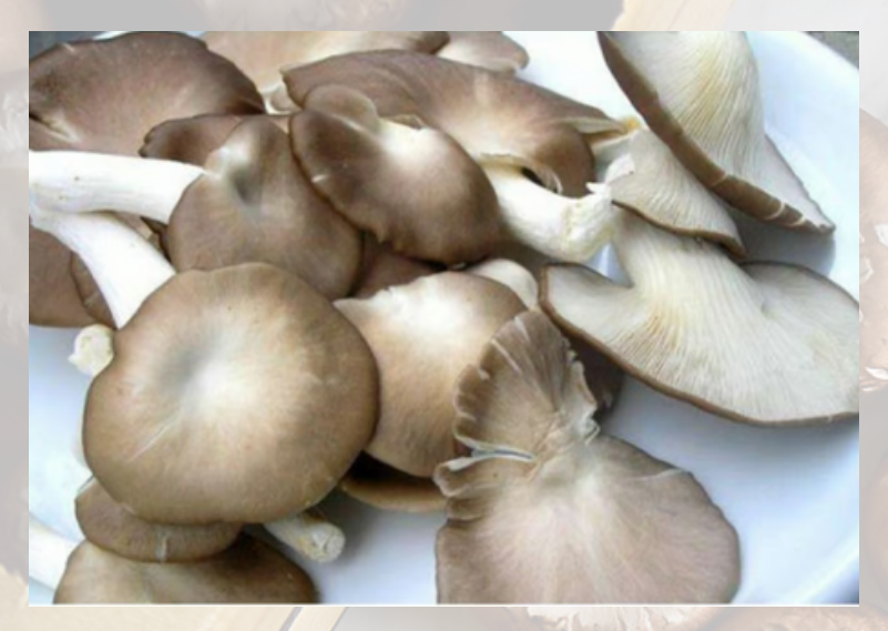
Oyster mushroom Spawn (Lentinus sajor-caju) Grey Oyster 2kg Rate: ₹199 (33% OFF)