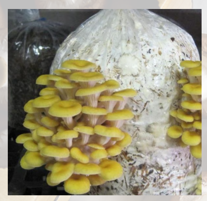
Golden Yellow Oyster Mushroom Spawn (Pleurotus citrinopileatus) 2kg