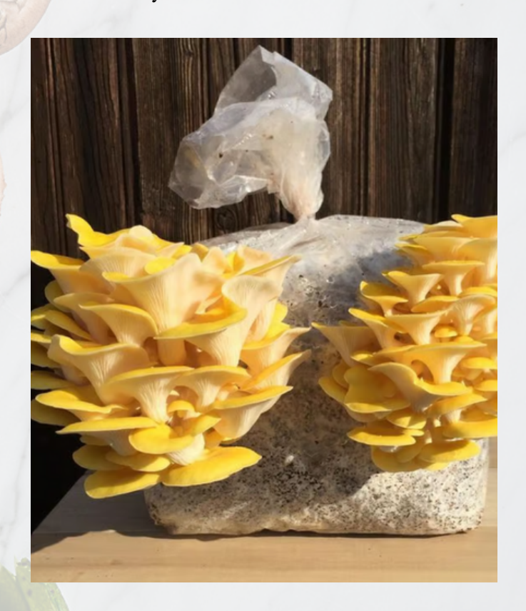
ONDC Registered product on Mystore app

Cultivated on nutritious substrates, our spawn ensures healthy growth and a bountiful crop of mushrooms. Known for their unique nutty flavor, Golden Yellow Oyster Mushrooms are a gourmet choice for culinary enthusiasts.