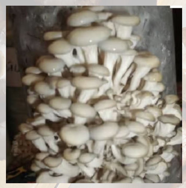
White Oyster mushroom spawn ( Florida Variety ) 2kg Rate: ₹199 (33% OFF)