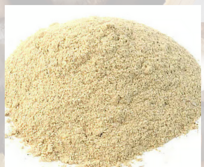
Organically grown Oyster Mushroom Powder 100 gm