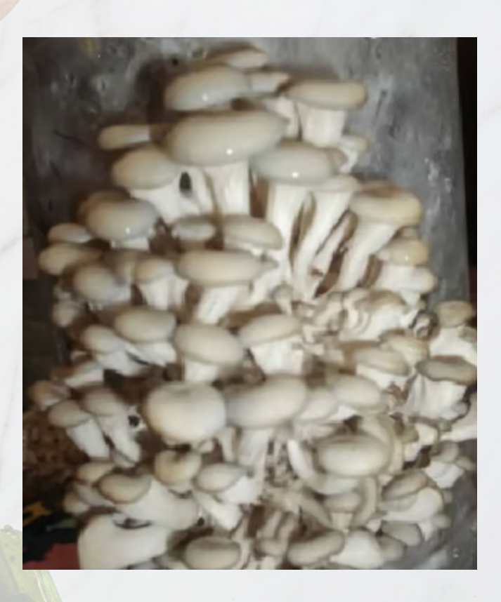
ONDC Registered product on Mystore app

Ensuring vigorous growth and superior yield, perfect for both personal and commercial cultivation.