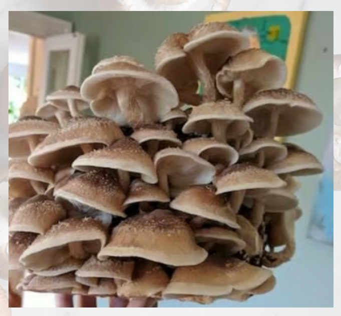
Shiitake Mushroom grain Spawn (Lentinula edodes)