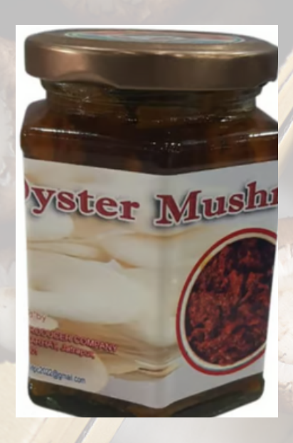
Mushroom Pickle 250 gm Rate: ₹150 (40% OFF)